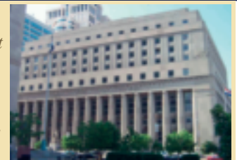
Mel Carnahan Courthouse